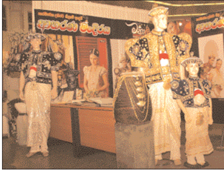
A traditional Kandyan wedding attire and some jewellery on display at the exhibition.

My Wedding 2009 Bridal Show and Exhibition organised by the CEC Events Pvt Ltd concluded last week at the BMICH. The show was consist with variety of fashion shows with Sri Lanka's finest models on the cat walk displaying the best of creations by leading fashion designers. The exhibitors comprised with service providers on bridal dress designers, beauty salons, professional photographers, cake decorators, caterers, hotels and jewellers. The next bridal exhibition "Vivaha" will be held on October at the BMICH.