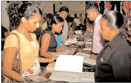
Visitors making inquiries.