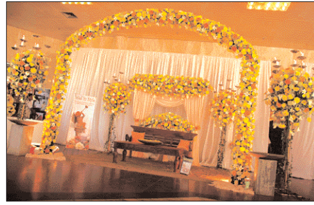
Flower decorations exhibit at the show