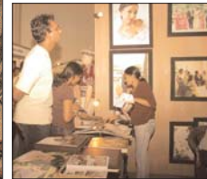
Visitors at the show