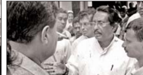
Minister Chandrasiri Gajadheera relating the incident to the media.