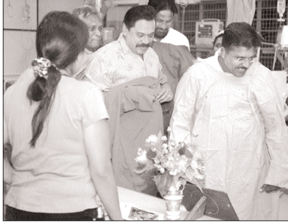
President Mahinda Rajapaksa yesterday visited the Colombo National Hospital to see injured Minister Mahinda Wijesekera.