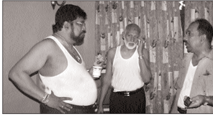
Ministers Pandu Bandaranayaka, A. H. M. Fowzie and Ameer Ali after the blast.