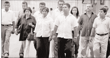
Postal Services Minister Mahinda Wijesekera's wife and relatives arriving at the hospital