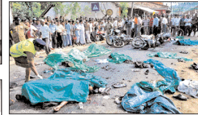
Soon after the blast