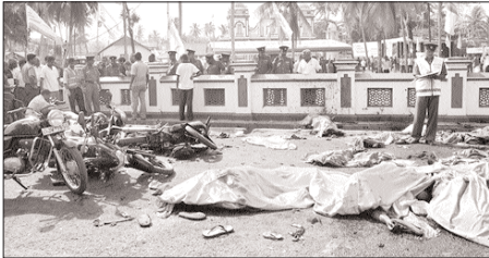
The blast site.