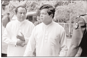
Ministers Lakshman Yapa Abeywardena and Bandula Gunawardena arriving at the National Hospital.