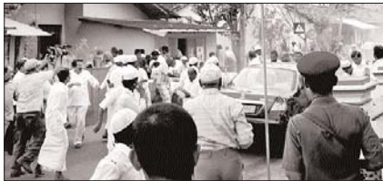
Seconds after the blast.