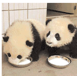
This milk is so delicious