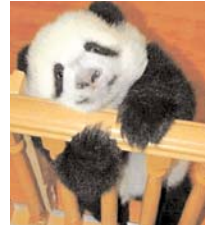
Home sweet home