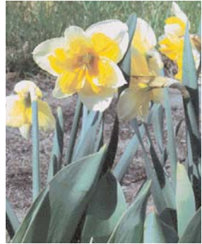
White Yellow Daffodil

the water, they built a mythology around it regarding a vain man looking at himself in the mirror. In ancient China, when the Chinese saw this beautiful white flower with a golden cup in the center, they built a mythology about a poor but good man, who was brought many cups of gold and wealth by the flower. Since the flower blooms around this time of year, it has also become a symbol of Chinese New Year.