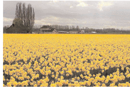
A Field of Daffodils

In kampo (traditional Japanese medicine), wounds were treated with narcissus