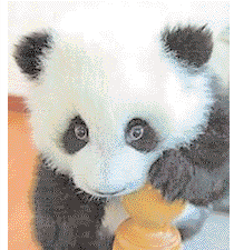
Look of cheekiness