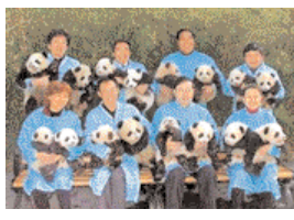
In the arms of angels