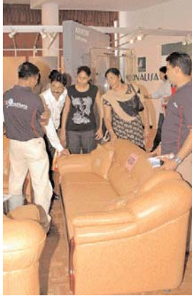
Customers purchasing furniture