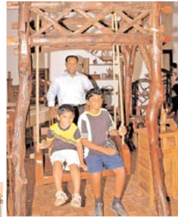
Young ones at the exhibition