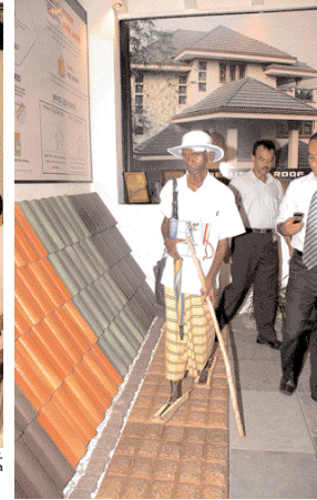
Visitor at the exhibition