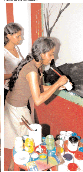
Wall painting at the Multilac stall