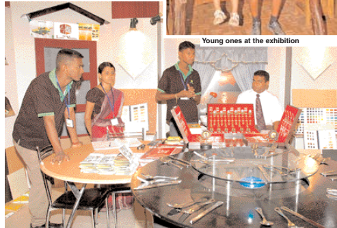
The Lanlo stall