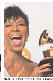
Natalie Cole holds the Grammy award for the Best Traditional Pop Vocal Album for "Still Unforgettable"