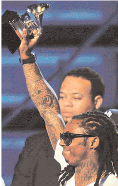
Rapper Lil Wayne accepts the Best Rap Solo Performance award.