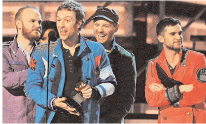
Chris Martin (2nd left) and other members of the band Coldplay, celebrate after winning the Grammy Award for the Best Rock Album for their album "Viva La Vida Or Death And All His Friends"