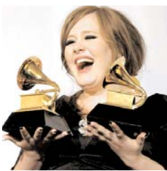
British singer Adele holds the Grammy award for the Best New Artist and Best Female Pop Vocal Performance for "Chasing Pavements"