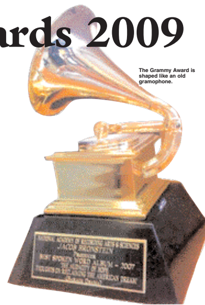
The Grammy Award is shaped like an old gramophone.