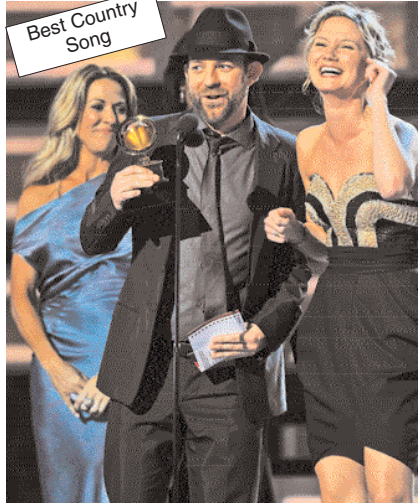
Performer Sheryl Crow (left) presents the Grammy Award for the Best Country Song to Kristian Bush (centre) and Jennifer Nettles (right) of Sugarland.