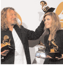
Former Led Zeppelin singer Robert Plant and bluesgrass queen Alison Krauss hold their Grammy awards. Plant and Krauss scooped five awards, including the coveted album of the year honor and record of the year prize for work stemming from their acclaimed "Raising Sand."