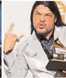
Robert Trujillo from Metallica holds the Grammy award for the Best Metal Performance for "My Apocalypse"