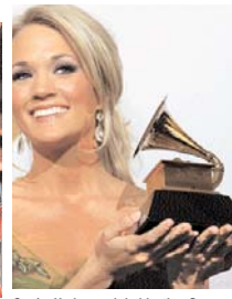
Carrie Underwood holds the Grammy award for the Best Female Country Vocal Performance for "Last Name"