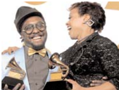
Christette Michele (right) and Will.i.am hold the Grammy award for the Best Urban/Alternative Performance for "Be OK"