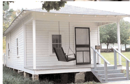
Elvis Presley was born in this home in Tupelo, Miss., on Jan. 8, 1935.