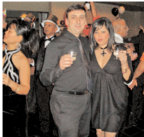
The crowd at Black Foot Inn Hotel, Calgary, Canada.