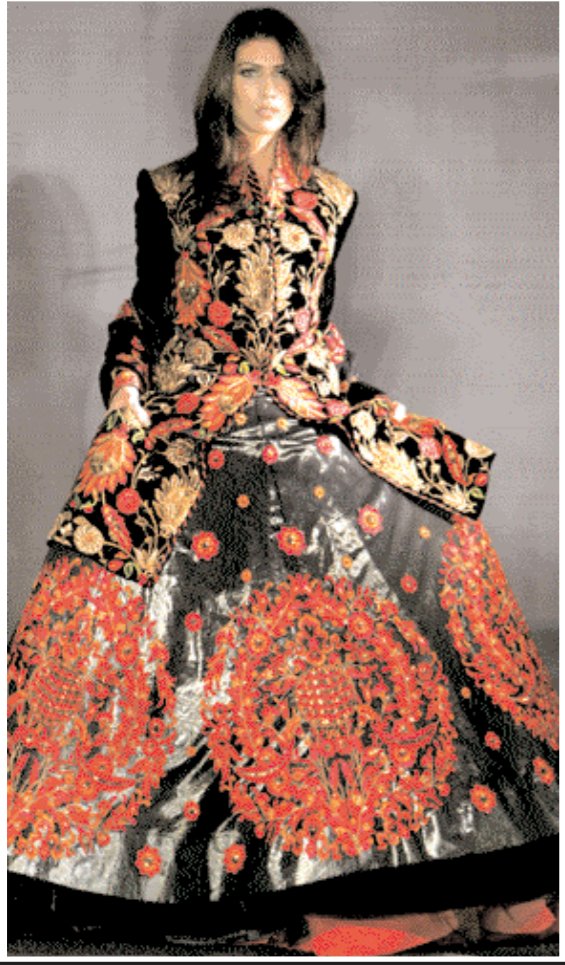
A model displays an ethnic creation by Rohit Bal at a fashion show in Bangalore, India, Thursday, Dec. 18, 2008.