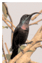
Long-billed Sun Bird