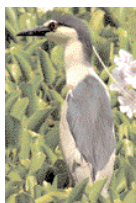
Black-crowned Night Heron