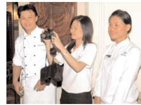
Thai chefs flown down to the event