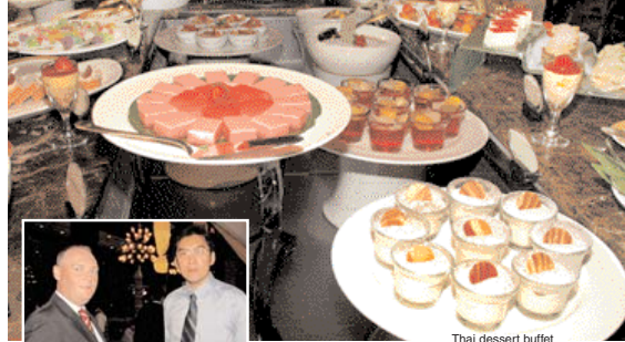
Thai dessert buffet