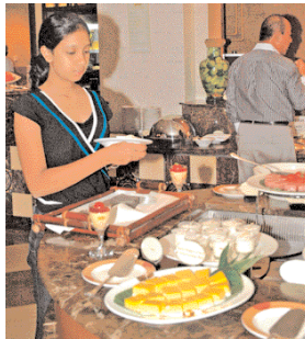
Wide selection of sweetmeats