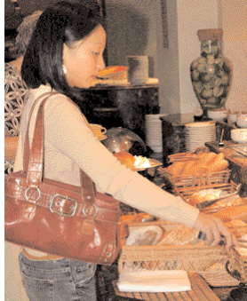
A diner in a dilemma?