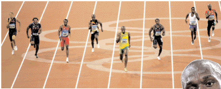
From left, United States' Wallace Spearmon, United States' Walter Dix, Netherlands' Antilles' Churandy Martina, Zimbabwe's Brian Dzingsai, Jamaica's Usain Bolt, United States' Shawn Crawford, Britain's Christian Malcolm and St. Kitts and Nevis' Kim Collins compete during the men's 200-meter final with a world record during the athletics competitions in the National Stadium at the Beijing 2008 Olympics in Beijing.