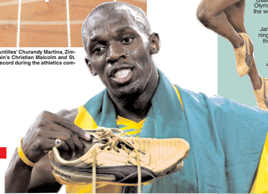
Usain Bolt holding his track shoes.