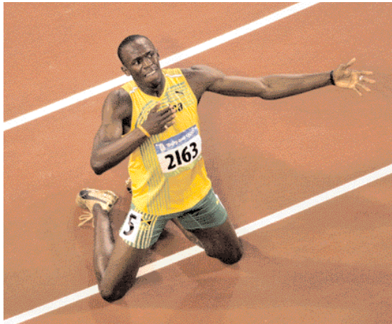
Usain Bolt celebrating.