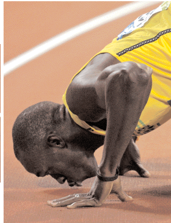
Usain Bolt kissing the track after winning the gold in the men's 200-meter final.