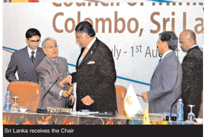
Sri Lanka receives the Chair