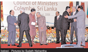
Highlights of the meeting (above and below)