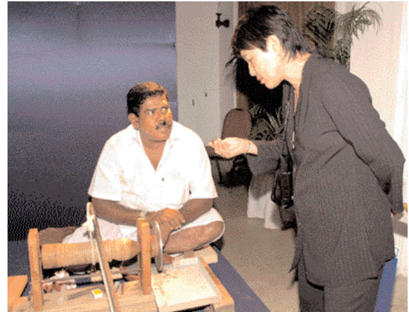
A foreigner taking a closer look at traditional way of cutting gems