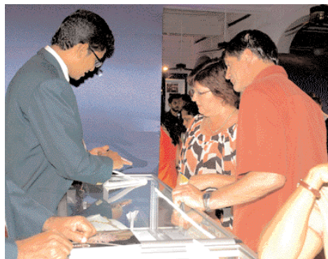
Forigners making inquiries