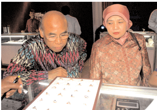
Another ring for me?