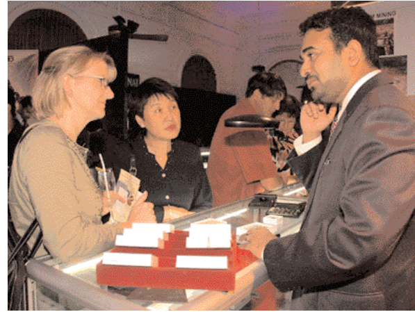
Forigners making inquiries