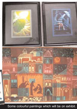
Some colourful paintings which will be on exhibit.

This exhibition and sale of work will be presented at the Barefoot Gallery