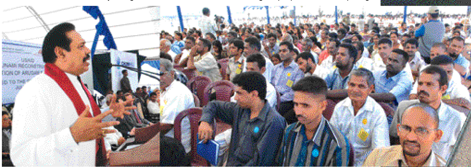
President Rajapaksa addressing the gathering