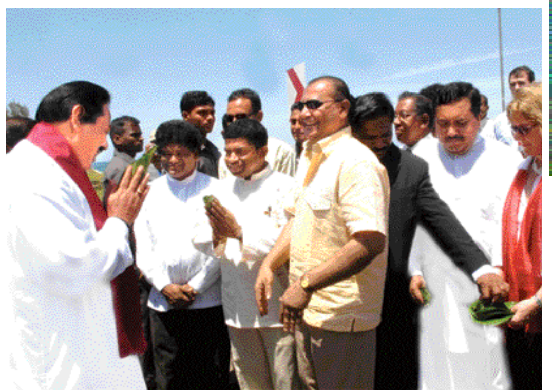
The President being greeted by the EP Chief Minister and others