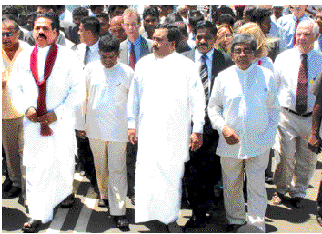
President Mahinda Rajapaksa being conducted to the bridge