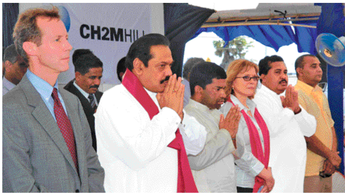
Participating in religious observances