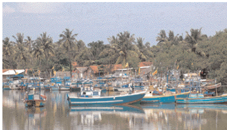
Boost for the fishing industry