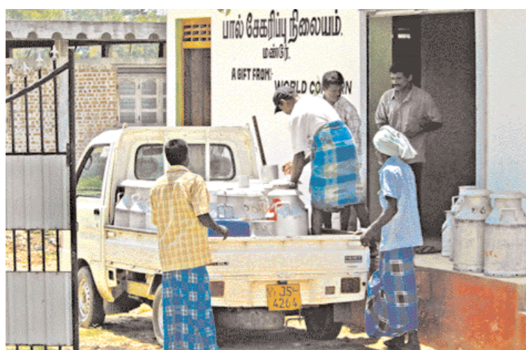
New milk collecting centres in Batticaloa