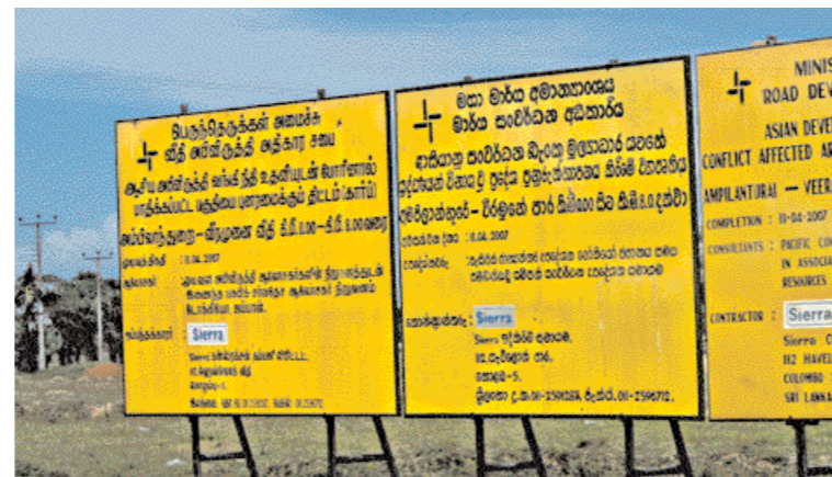
Road development in progress