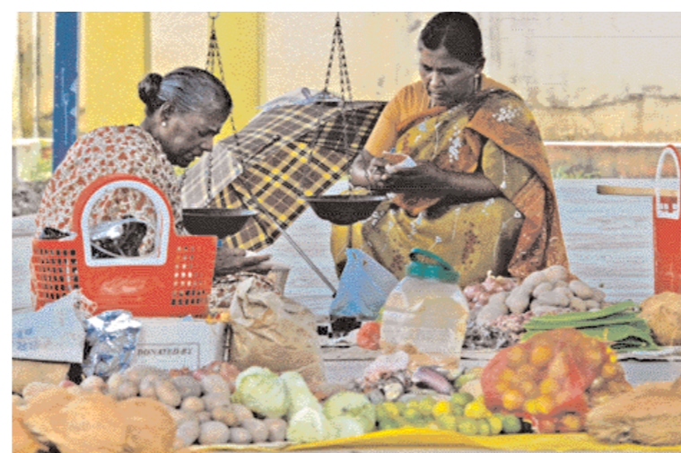
Brisk vegetable sales