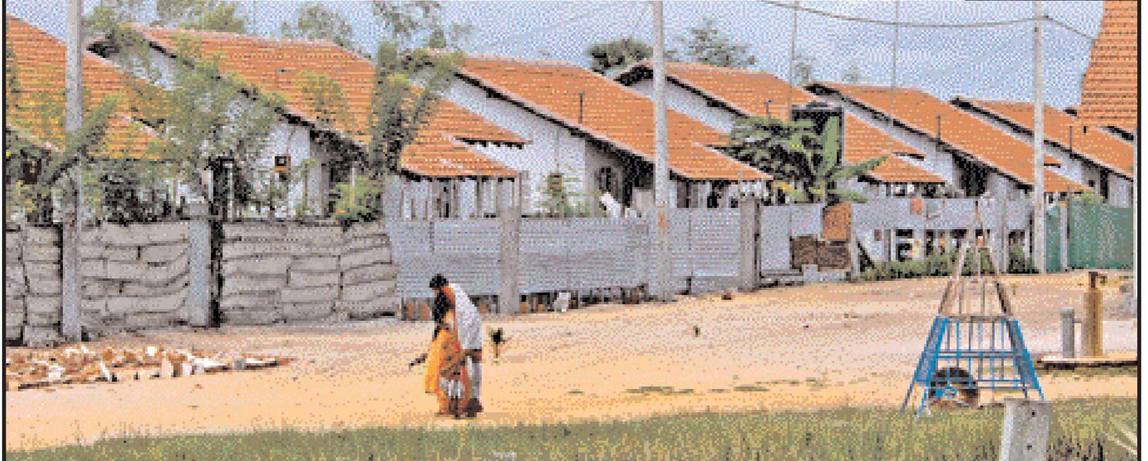
New houses for the displaced in Batticaloa

The East which opens a new chapter following the eviction of the LTTE, houses all the necessary ingredients for such a development revolution, with the enormous resources it possesses.