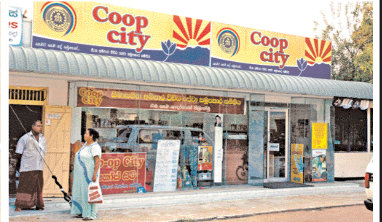
Co-op city in Ampara