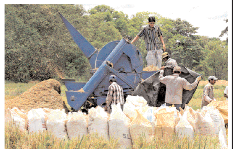
Paddy processing centres in the East