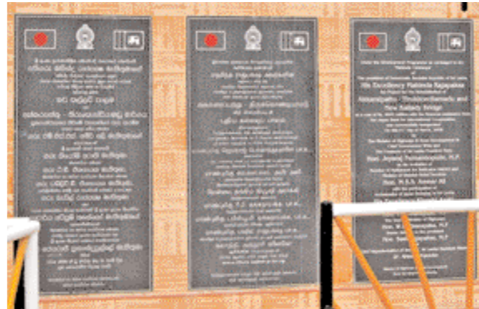
Foundation stone for the new Kalladi bridge