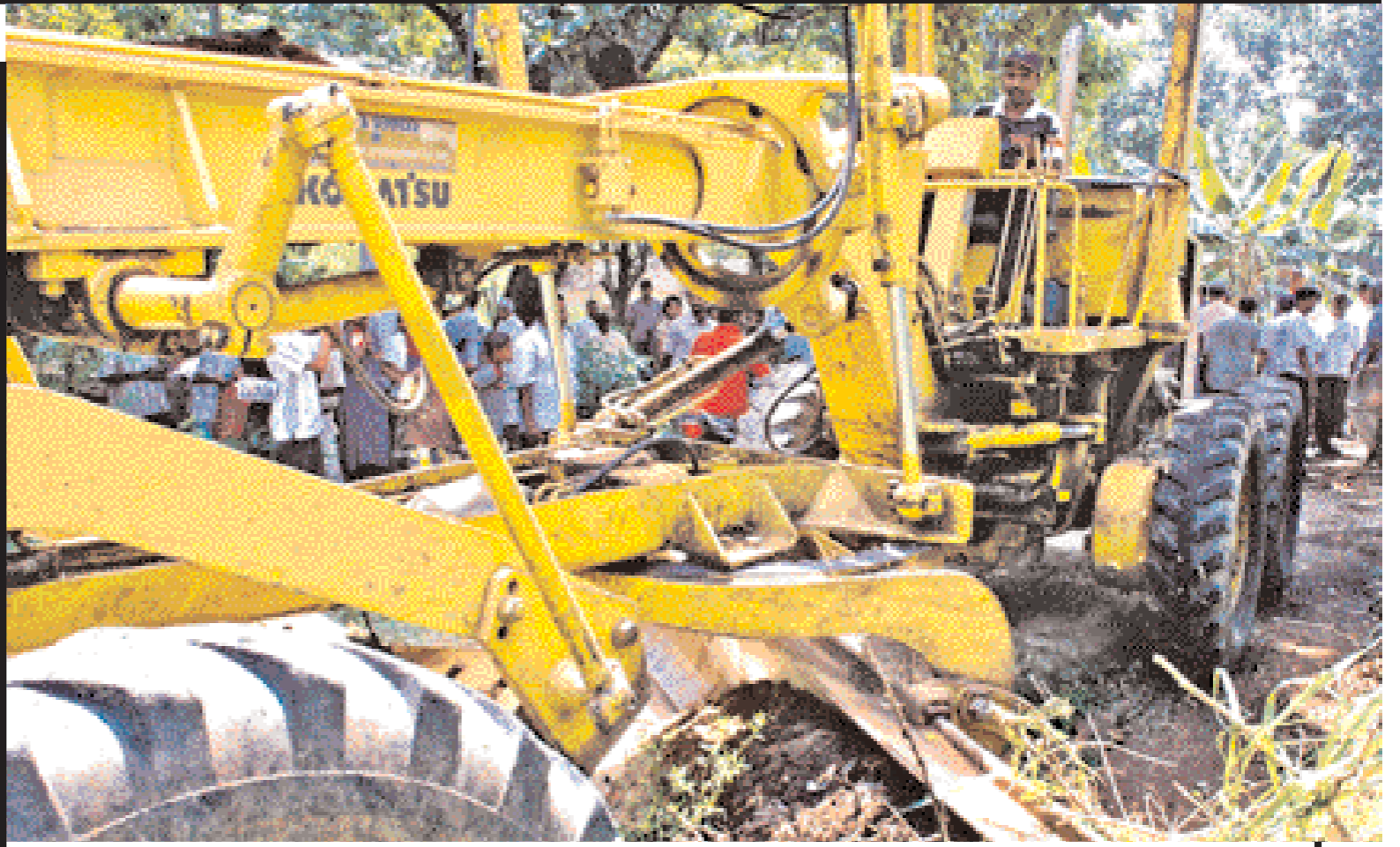
Road under construction in Padiyatalawa, Ampara

It is also home to all three major communities in substantial proportions which makes the East, a unique landscape on the Sri Lankan map. Thus it is no doubt that the East would achieve great heights in the near future. These pictures tell a story to this effect, but it is still only the tip of the iceberg.