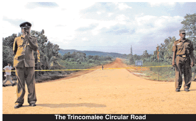
The Trincomalee Circular Road

The East which opens a new chapter following the eviction of the LTTE, houses all the necessary ingredients for such a development revolution, with the enormous resources it possesses.