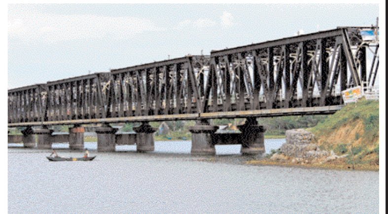
Bridges like this are development projects undertaken by the Government