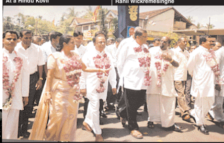
At a public function