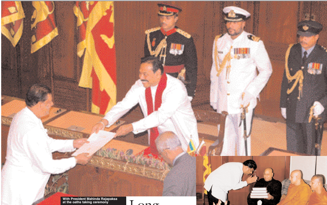
With President Mahinda Rajapaksa at the oaths taking ceremony