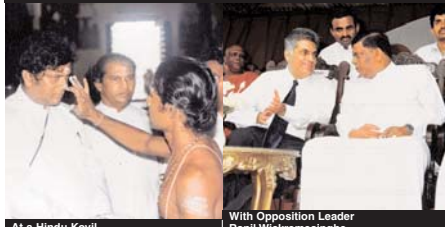
At a Hindu Kovil