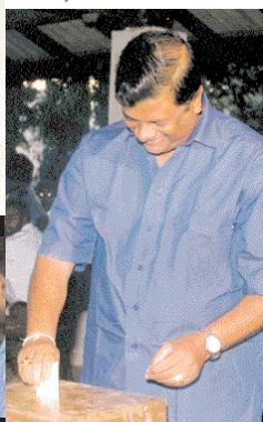
Casting his vote at an election

This Government Whip was not afraid to say anything against those who harm the image of the country.