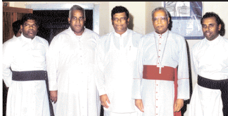
With Catholic priests