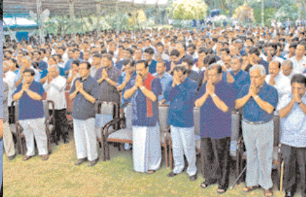
At last Sunday's SLFP Convention at Temple Trees