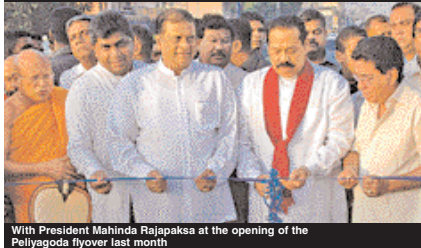
With President Mahinda Rajapaksa at the opening of the Peliyagoda flyover last month