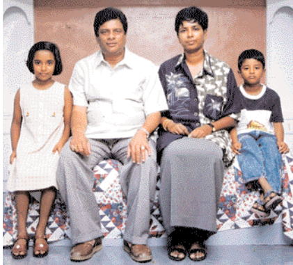
The late minister with his family