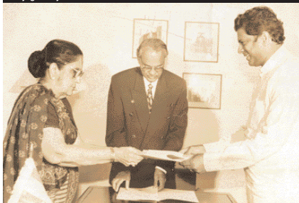
Taking oaths before Prime Minister Sirimavo Bandaranaike