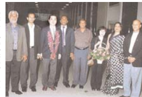
The foreign visitors and the Lion Club members soon after the arrival of the visitors at the BIA.