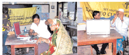
A Free Eye Clinic organised by the Old Boys' Association of Madina Central (National School) College-Colombo Branch in Collaboration with the Lions Club of Colombo (Hosi) and Norfolk Footis (Pvt) Ltd was held at Madina Central College premises recently. Here, officers are examining eye sights of the needy.