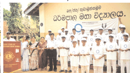
To mark the world Diabetes Day Lions Club of Mulleriyawa New Town, distributed leaflets on the prevention of Diabetes to the general public. This was done with the participation of the school children principal and staff of Kotikawatte Kudabuthgamuwa Dhamapala Vidyalaya and in association with the National Diabetes Centres. To mark the occasion, tee-shirts and caps were distributed to school children by the National Diabetes Centre. Here pupils of Kotikawatte, Kudabuthgamuwa Dhamapala Vidyalaya, with the school staff at the commencement of the distribution of the leaflets.