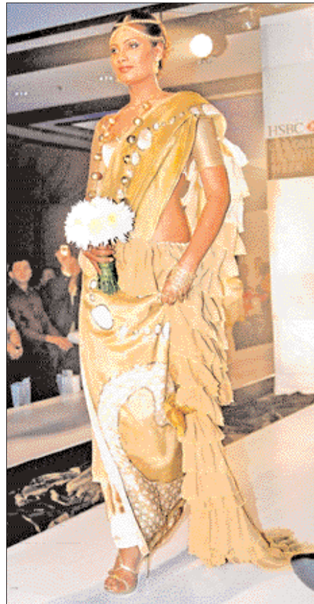
Buddhi Batiks - contemporary Kandyan bride