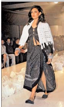
Bibi Russel of Bangladesh