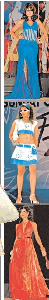
Some of the designs on display