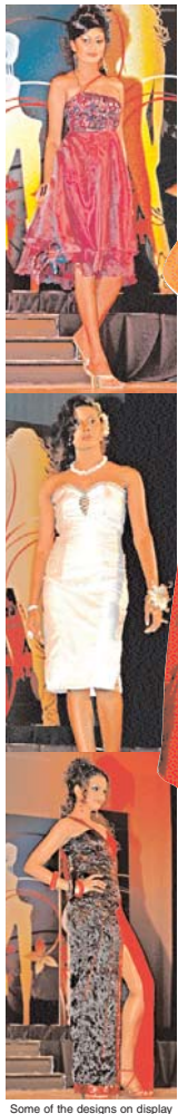
Some of the designs on display