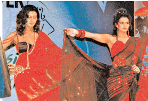
Saree wear segment