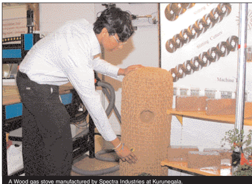
A Wood gas stove manufactured by Spectra Industries at Kurunegala.