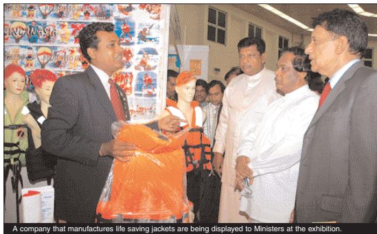
A company that manufactures life saving jackets are being displayed to Ministers at the exhibition.