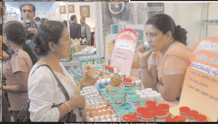
Treatment for skin diseases at the Ayush Ayurveda Kendra