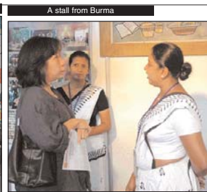
A stall from Burma