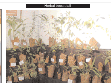
Herbal trees stall