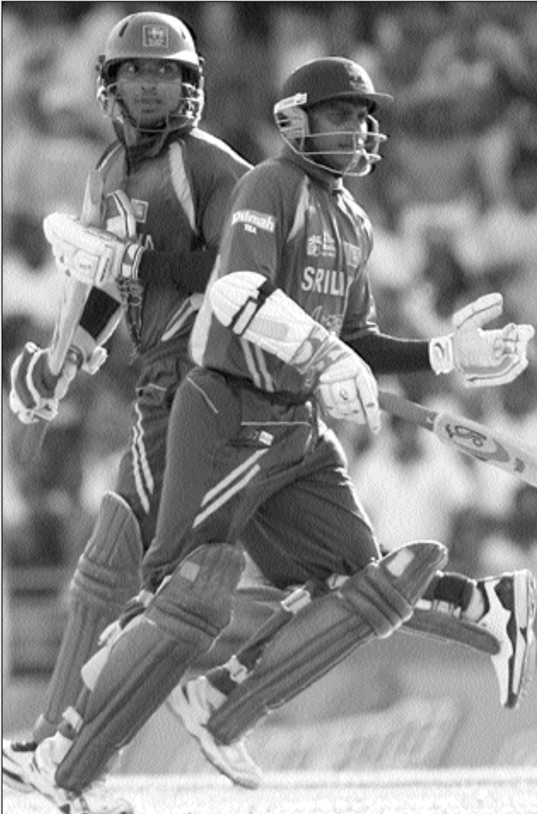
Kumar Sangakkara and Sanath Jayasuriya run between the wickets s they bat against Australia.