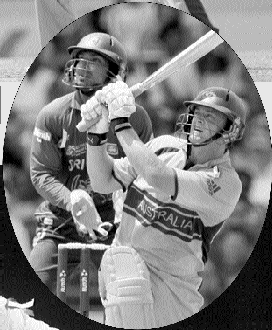
Adam Gilchrist strikes a six off the bowling of Sri Lanka's Muttiah Muralitharan .