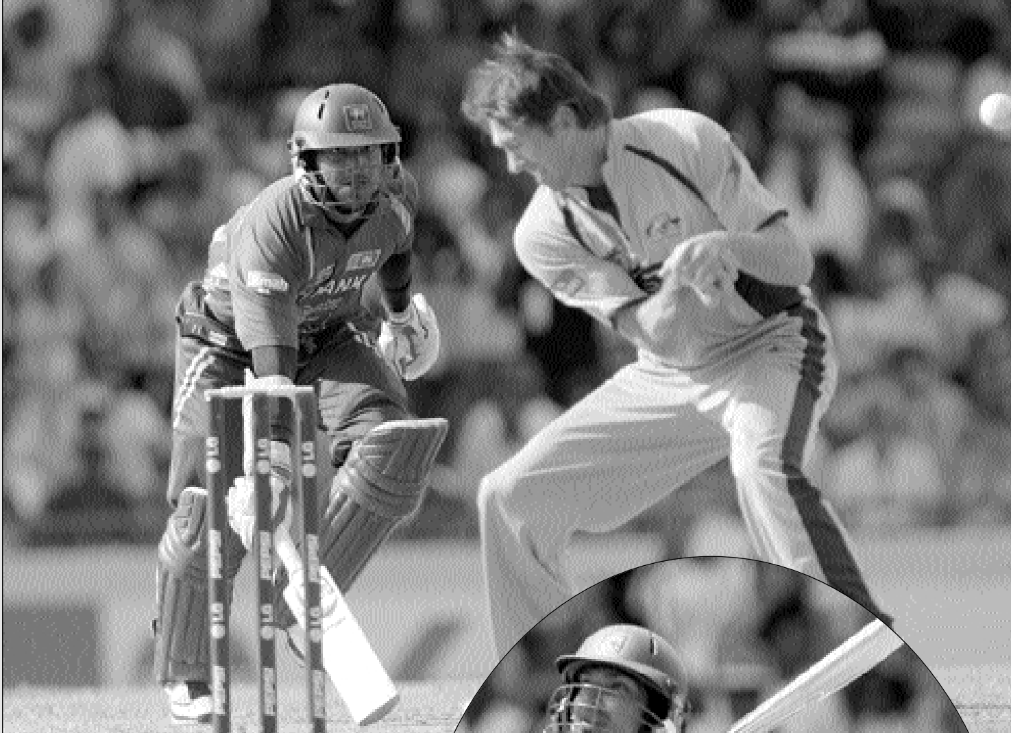
Kumar Sangakkara, left, survives a run out attempt by Australia's bowler Glenn McGrath.