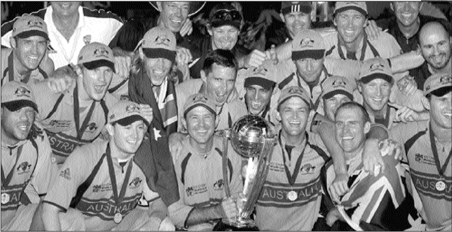
Australian cricketers pose with the trophy of the ICC Cricket World Cup 2007 at the Kensington Oval in Bridgetown.