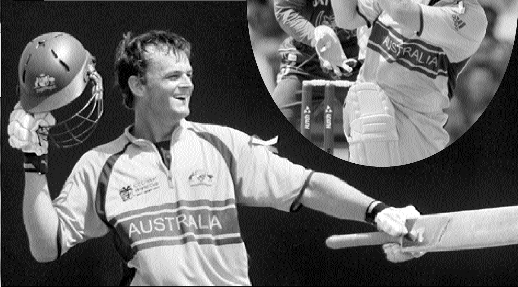
Adam Gilchrist celebrates after scoring a century.