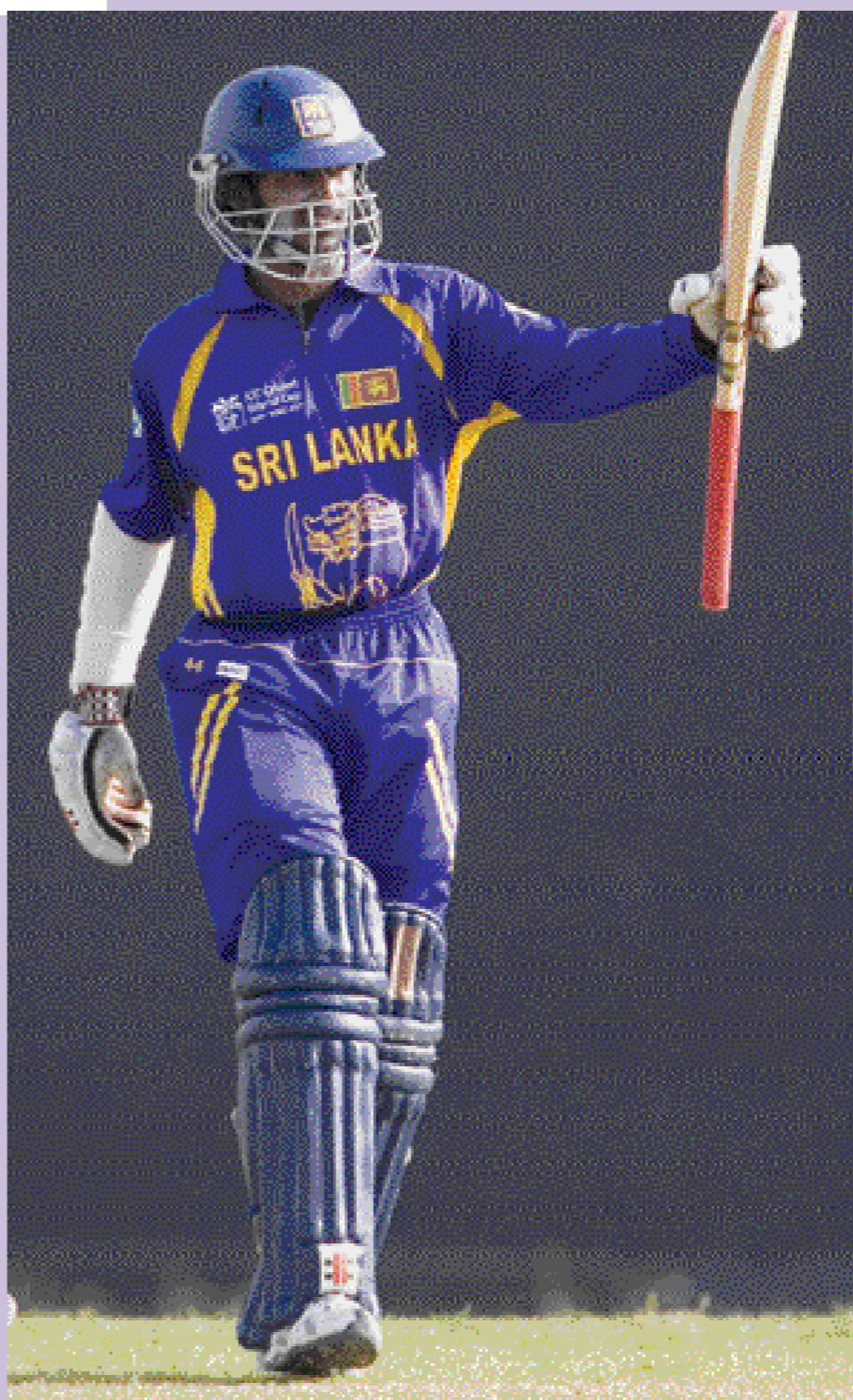
Sri Lanka's Upul Tharanga raises his bat to celebrate his century during their World Cup cricket warm-up match against New Zealand in Bridgetown.