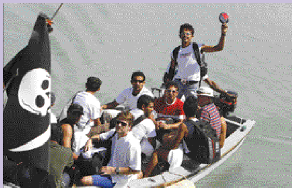
Indian players enjoy a boat ride in the Caribbean Sea on the eve of World Cup cricket opening ceremony, in Montego Bay.