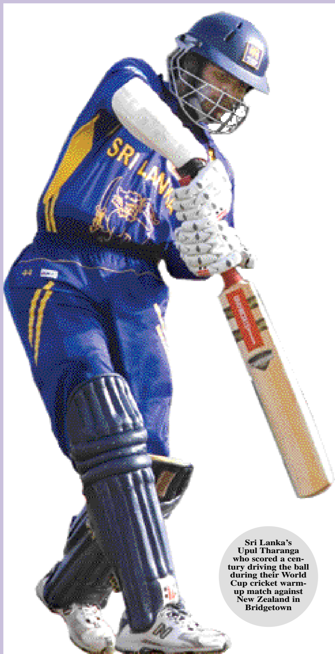
Sri Lanka's Upul Tharanga who scored a century driving the ball during their World Cup cricket warm-up match against New Zealand in Bridgetown