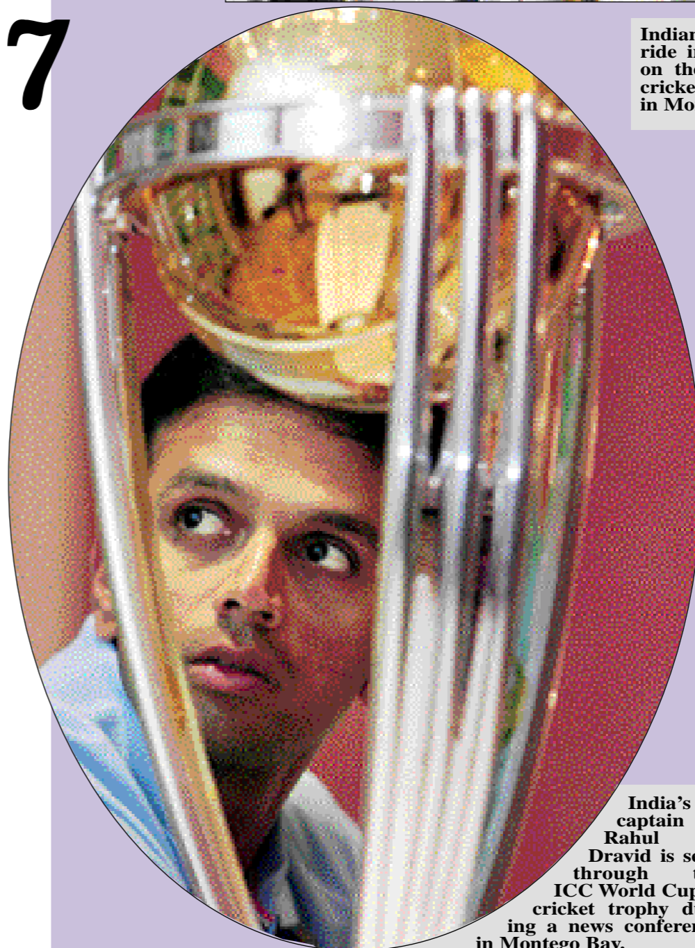
India's captain Rahul Dravid is seen through the ICC World Cup cricket trophy during a news conference in Montego Bay.