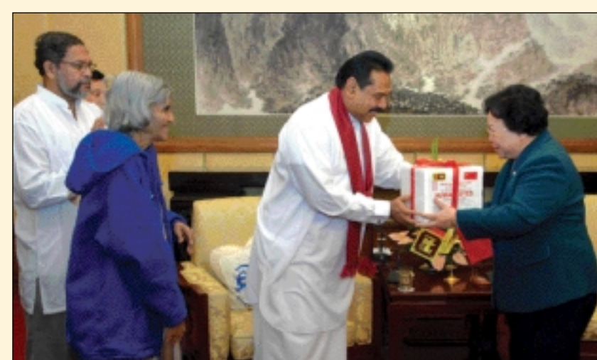
Donating corneas to the Chinese Red Cross