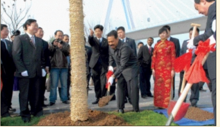
The President planting a tree at the World Peace Park in Yichang