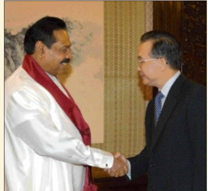
The President with Chinese Prime Minister Wen Jiabao