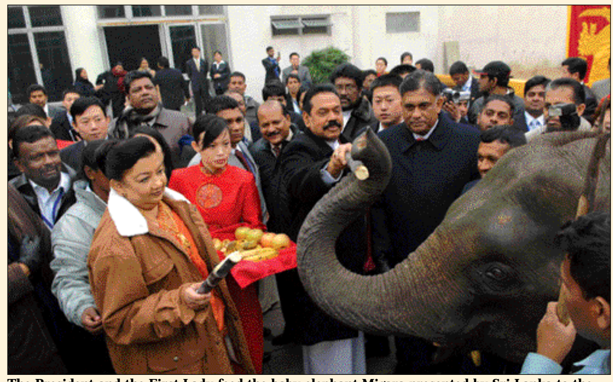
The President and the First Lady feed the baby elephant Migara presented by Sri Lanka to the Chinese people