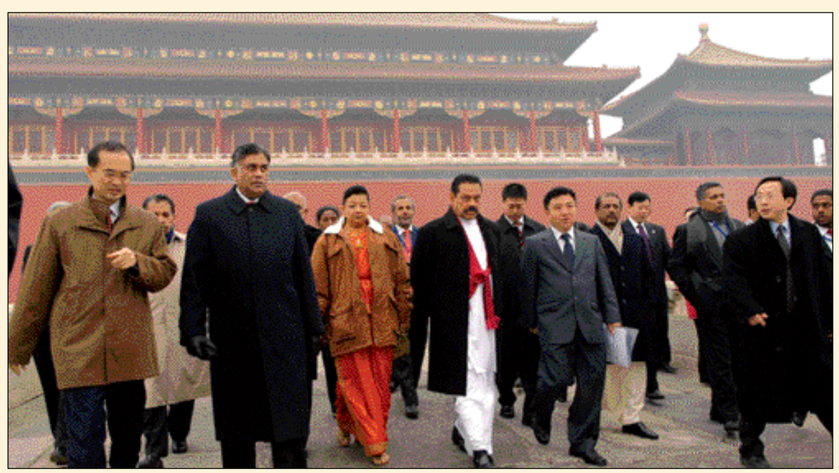
Visiting the Forbidden City