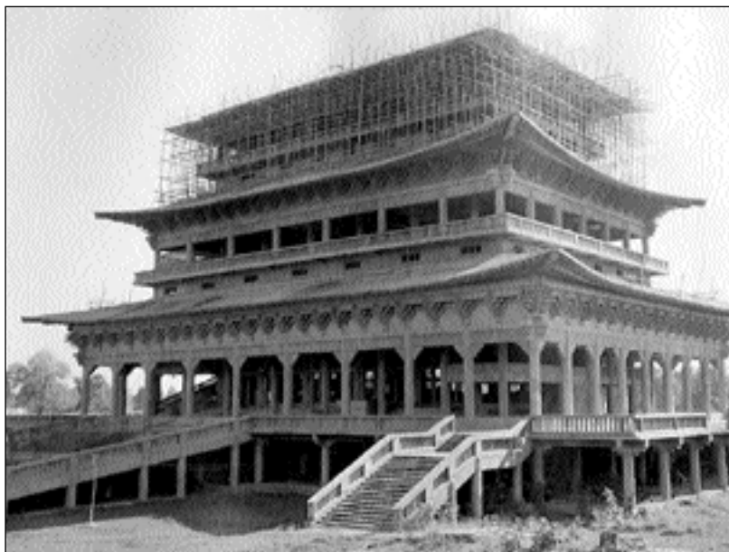
Korean Monastery (under construction)