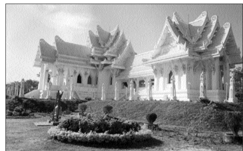
Royal Thai Monastery