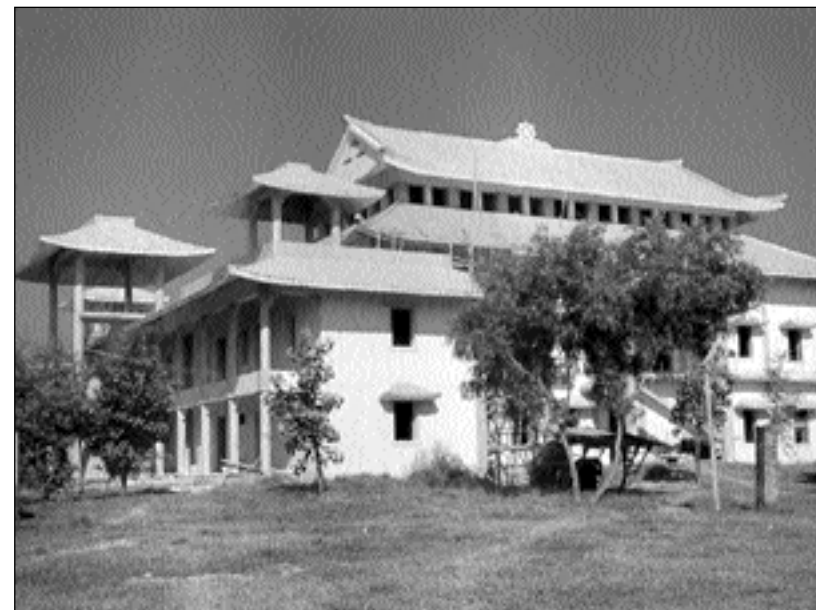
Linh Son Monastery of France. (under construction)