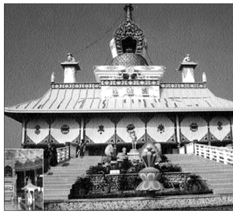
Tara Foundation of Germany