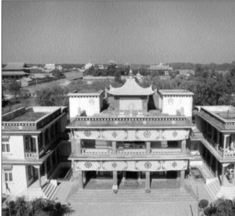
Nepal Mahayana Temple