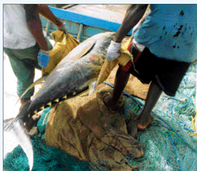
Loading and unloading