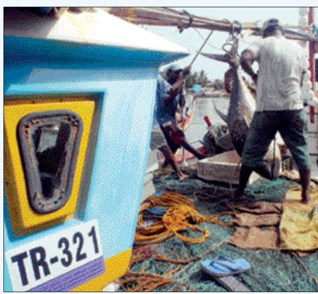
The life struggle