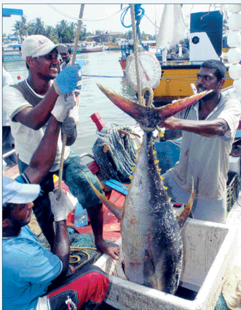
Weighing the big catch