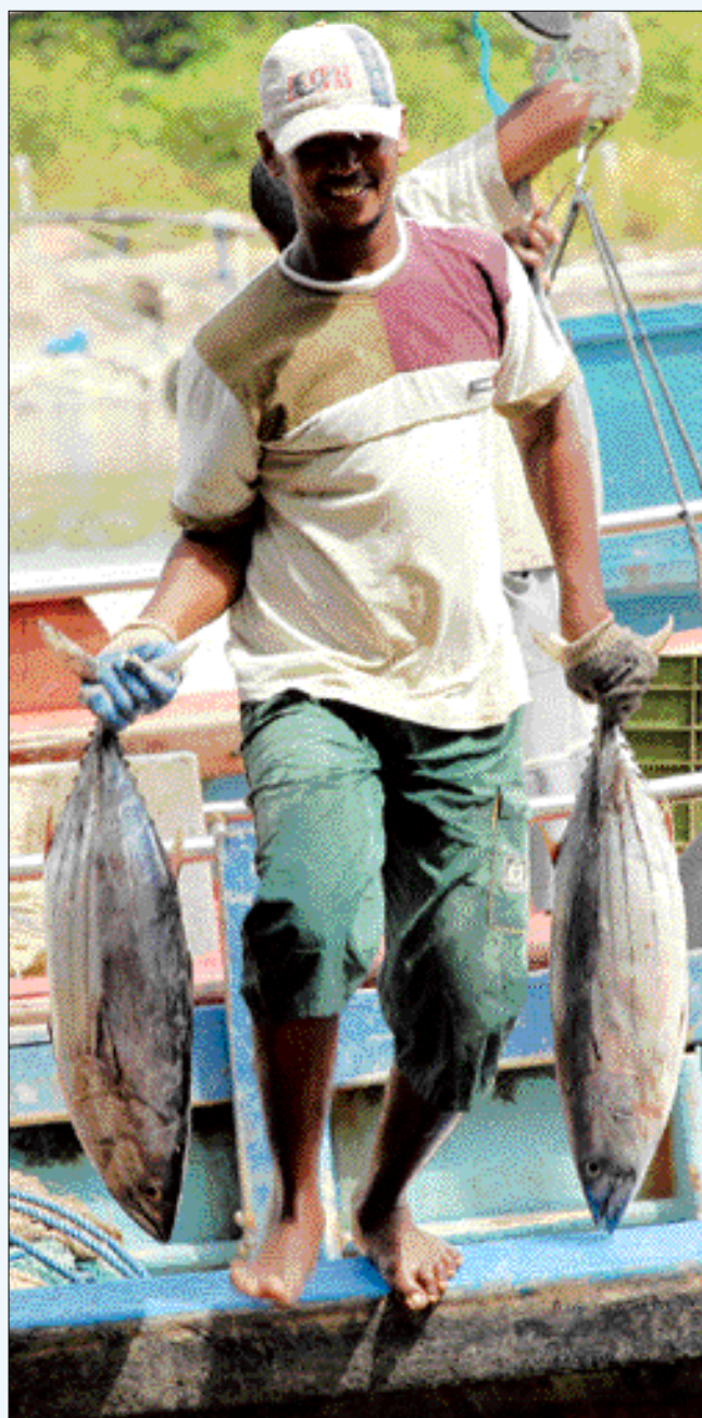
A big yield