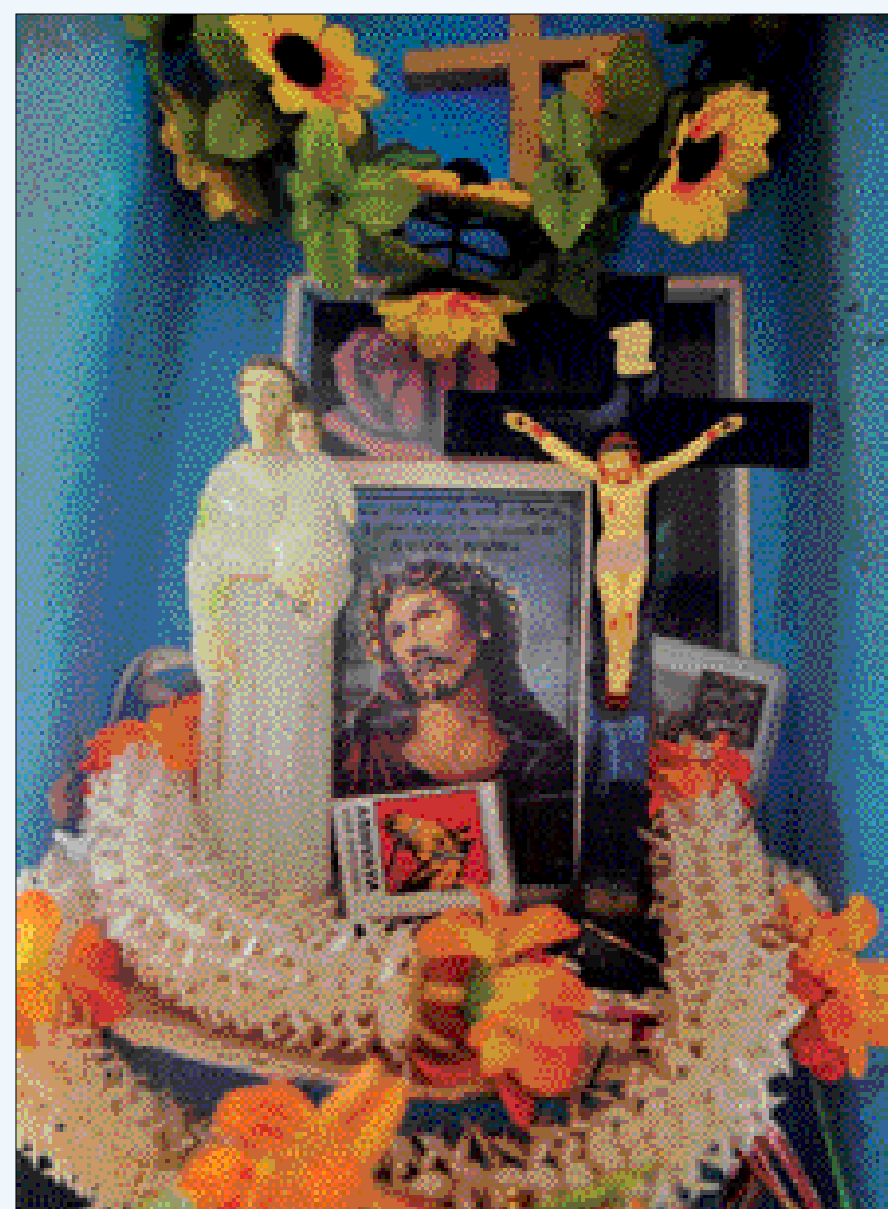
Faith for protection