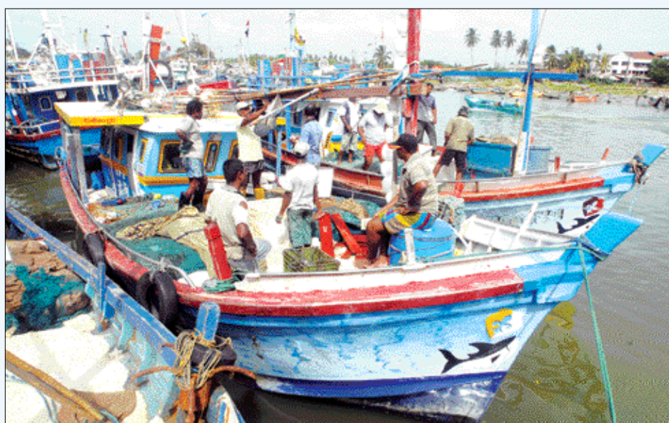
A Multi- Day craft