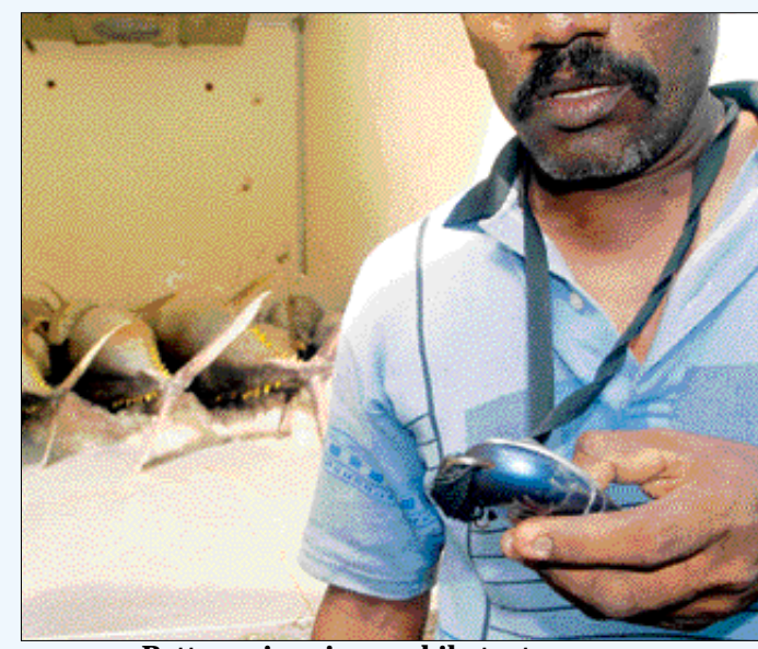
Better price via a mobile text message