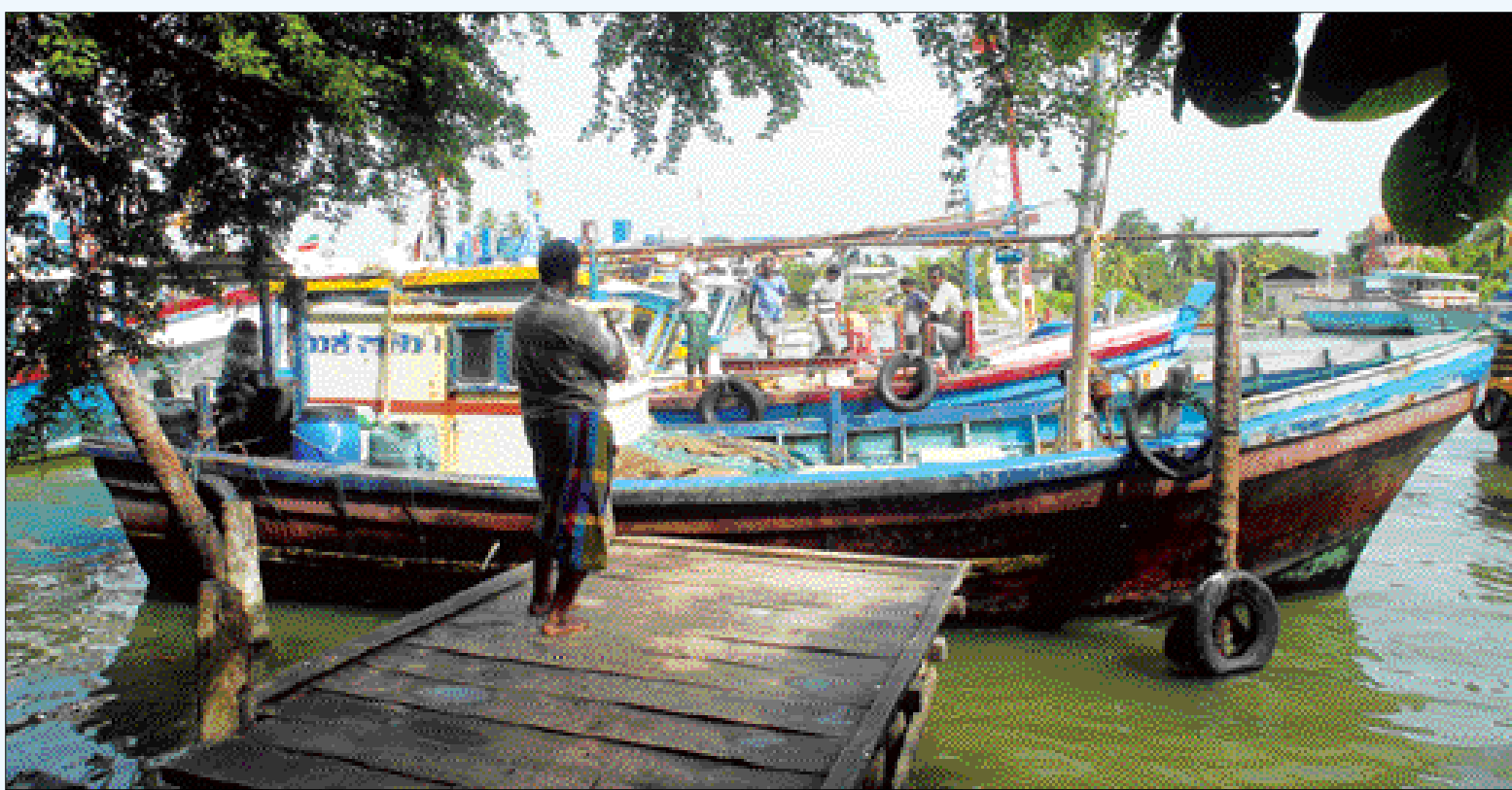
A rest after two weeks

NEGOMBO: Two weeks ago a Red and Blue strip 30 foot long Multi-Day fishing craft named "Chamika Duwa" (Daughter Chamika-TR-321) went to sea during this off season. Last Sunday it returned to the Negombo fisheries harbour with a catch of between one and a half and two tons of Tuna fish. "Daughter Chamika" was built two years ago at a cost of Sri Lankan Rs. 2.5 million and registered under the number TR-321 which was given by the Fisheries Harbor Ministry. Five Sri Lankan fishermen are employed and they travel more than 100 nautical miles for two weeks in to the deep-sea carrying seven naval meters long 250 large hooks to catch Tuna fish. Good or bad weather, they go out to sea with their faith in God and contribute a significant amount to the national income. The Security Forces are planning to register all fishing craft with a new visible number due to security reasons. This is to safeguard the fisher folk in the Island.